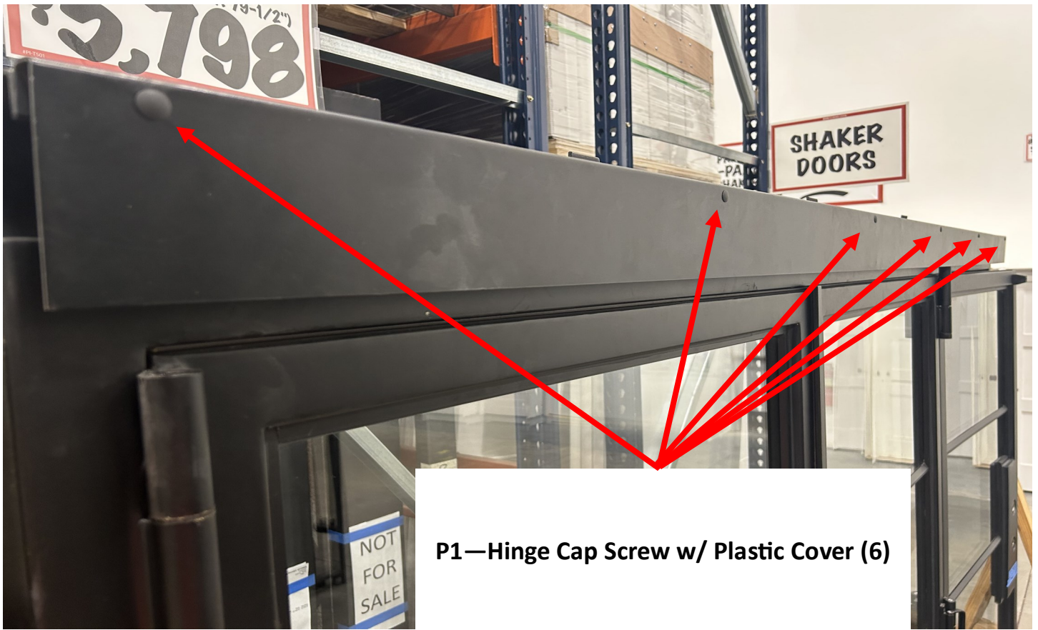
P1—Hinge Cap Screw w/ Plastic Cover (6)