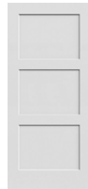
3-PANEL SHAKER FP-730