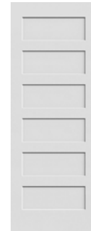
6-PANEL (8/0 TALL ONLY)