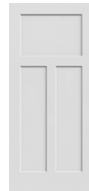
CRAFTSMAN SHAKER FP-760