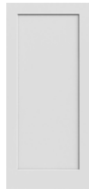
1-PANEL SHAKER FP-720