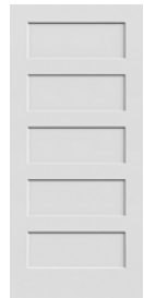
5-PANEL SHAKER FP-755